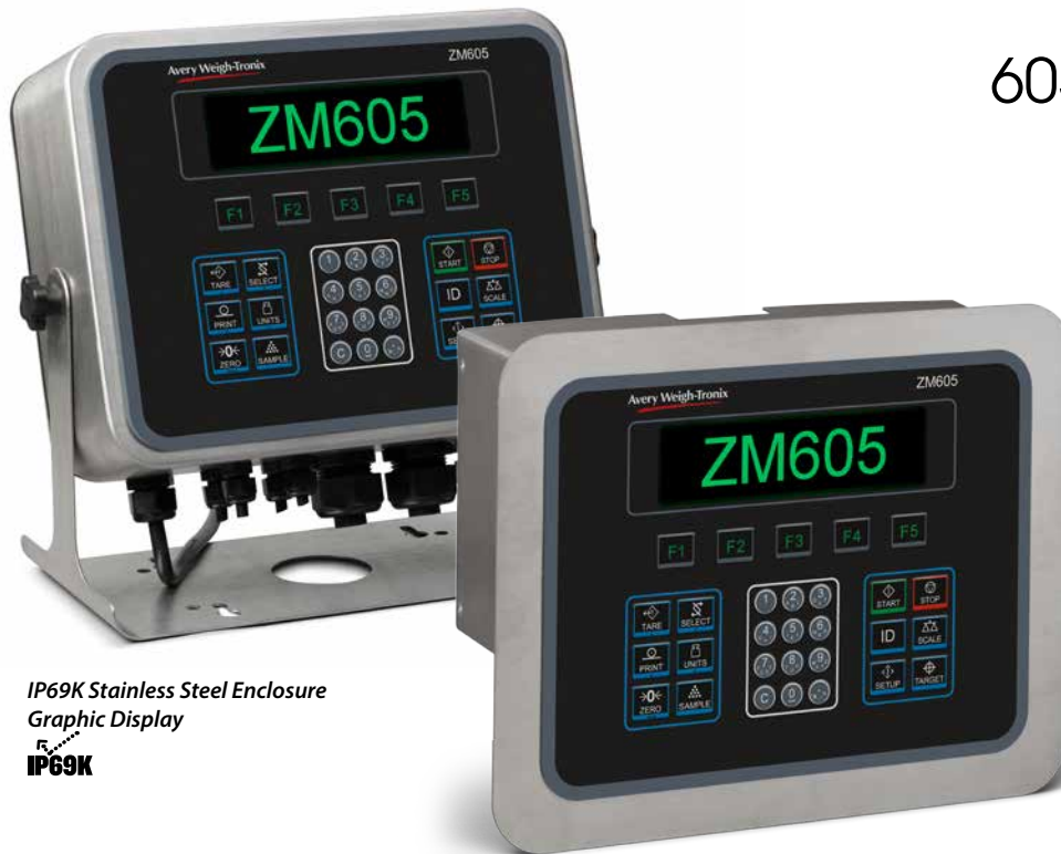
IP69K Stainless Steel Enclosure Graphic Display IP69K