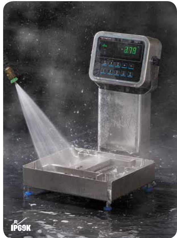
Easy to remove base cover for thorough cleaning

We recognize that good hygiene is vital to business success in the food industry. In line with USDA and other sanitation and hygiene standards, this NSF certified piece of equipment guarantees hygiene safety at all times. The ZQ375 has been designed for ease of cleaning. A smooth pickled and polished surface finish helps to stop microorganisms from growing on the surface of the scale. Curved corners and the easy-to-remove cover make thorough cleaning simple, fast and effective, minimizing food trap areas where bacteria could thrive. All threads are hygienically covered with domed nuts to aid and speed up cleaning processes.