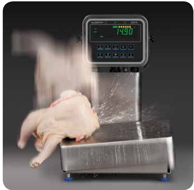
Torsion base features 500% shock loading protection

Able to withstand up to 500% shock loading, our breakaway load transfer system helps to guarantee accuracy and reliability at all times. This specialized base automatically transfers shock loads and overloads away from the load cell back to the base frame, ensuring that the scale's accuracy and performance is not affected. Unlike other designs used to reduce shock loading, this food grade stainless steel design offers a clean and uncomplicated solution that is fully NSF Certified and washdown resistant.