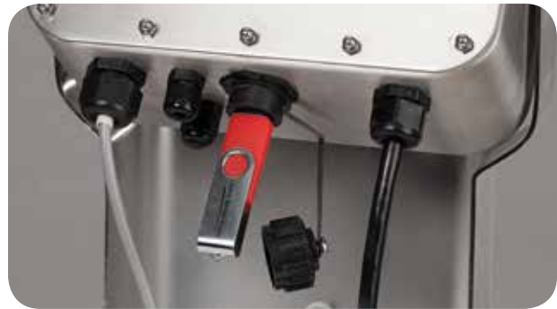
USB with optional waterproof gland